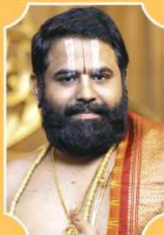
SRI SRIMANNARAYANA PURANAM