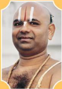
SRI SESHAVATARAM PURANAM